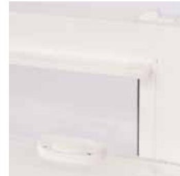
Tilt latches and locks