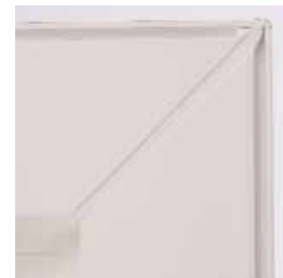
Clean, detailed welded corners