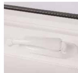
High quality hardware